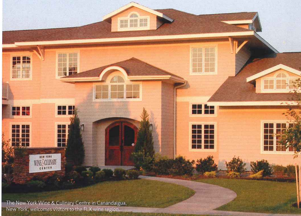
The New York Wine & Culinary Centre in Canandaigua, New York, welcomes visitors to the FLX wine region.