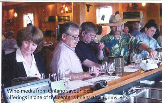
Wine-media from Ontario savour local offerings in one of the center's fine tasting rooms

Tasting wines in Finger Lakes has a very special spirit of conviviality. Wineries enthusiastically welcome visitors and there are many delightful spots to lunch, dine or just bask in the lake-reflected sun. Inns, B&Bs and modest motels make lodging easy and comfortable, and there are plenty of diversions like farmers' markets, gorges, vistas and even Watkins Glen's famous NASCAR speedway if you need a break from incessant imbibing.