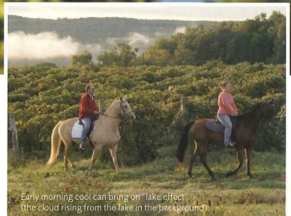
Early morning cool can bring on "lake effect" (the cloud rising from the lake in the background).

These deep, cold slivers of water slice through some of the earth's most spectacular geology and create very special growing conditions for grapes. Grapevines love rocks, and the Finger Lakes offer 400 million-year-old Devonian sediments, pressure-fused to form flakey layers of shale and sandstone. Geologists