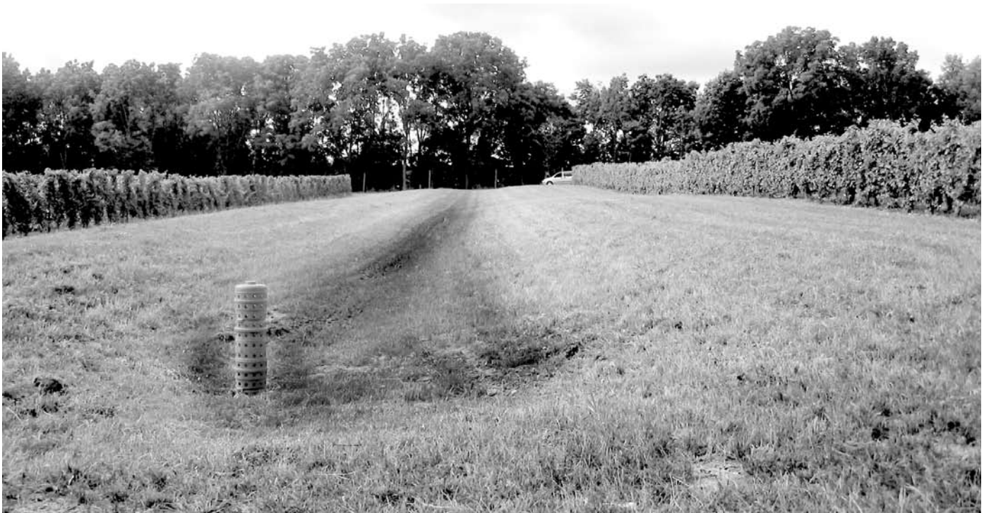
Diversion ditches separating two young vineyard blocks. Note standpipe in foreground.