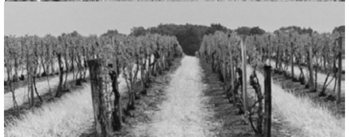
Vineyard floor management (top to bottom): permanent sod, straw mulch, seeded row middle, and killed sod in row middle.