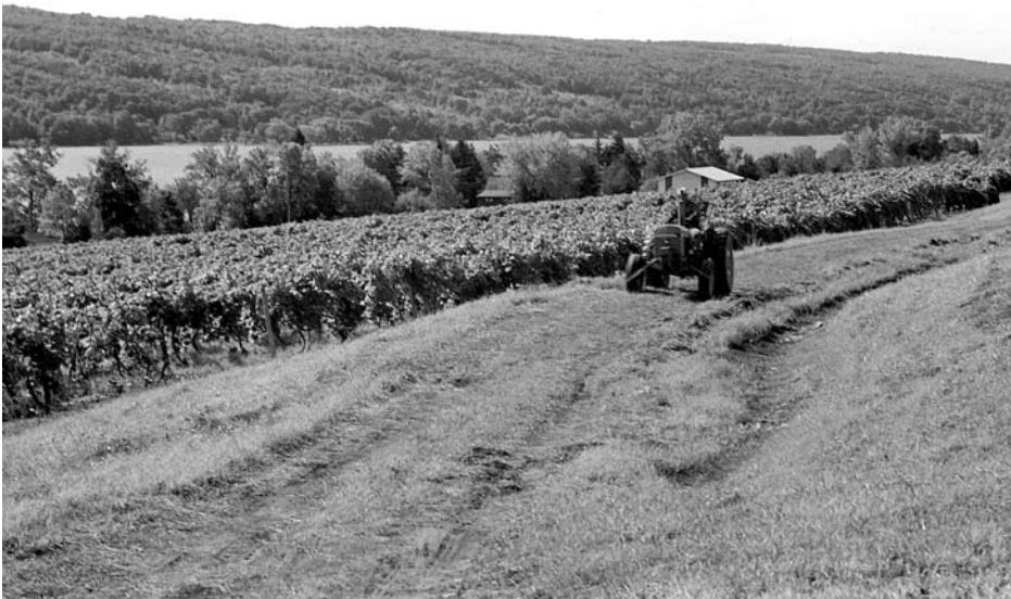
Diversion ditches channel excess water around vineyards, reducing potential runoff and erosion.