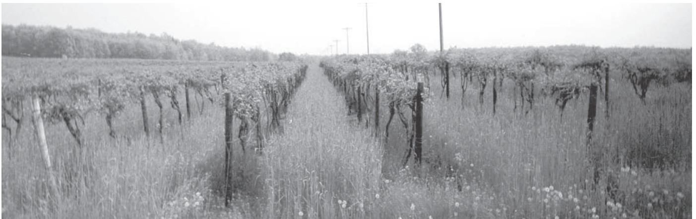
Cereal rye seeded in row middles protects soil from the force of raindrops hitting bare soil.

Soil conservation practices prevent erosion and maintain clean water in three ways. First, diversion of water around vineyards keeps water clean, because it doesn’t wash over disturbed soil in the first place. Filtering of water through soil (drainage systems) and ground cov-