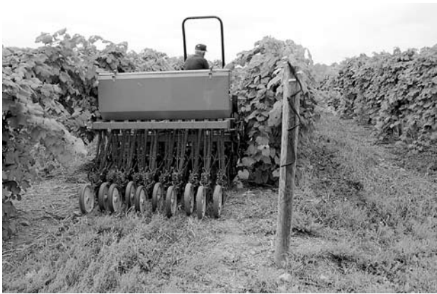
This No-till seeder plants cover crops without the need for additional soil protection, maintaining protective stubble on the surface while the cover crop germinates.

Using cover crops and mulches to protect the soil surface has an enormous effect on annual rates of erosion. Mulches reduce the force of rainfall hitting the soil by 98%, according to Jim Balyczek, Yates County Soil Conservation District Manager. Use of permanent cover crops in row middles on a 10% slope with 200 ft slope length reduced potential annual erosion from 5.1 T/acre under ‘clean tillage’ to 0.39 T/acre, in an example provided by Tibor Horvath, NYS Conservation Agronomist, USDA Natural Resources Conservation Service.