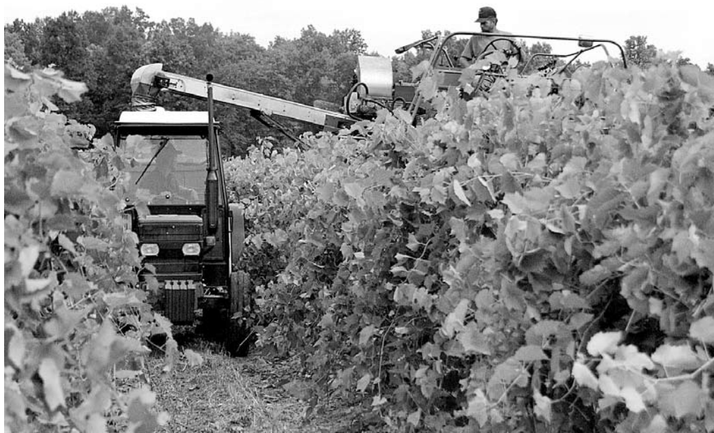
Using soil conservation practices helps maintain productive vineyards.